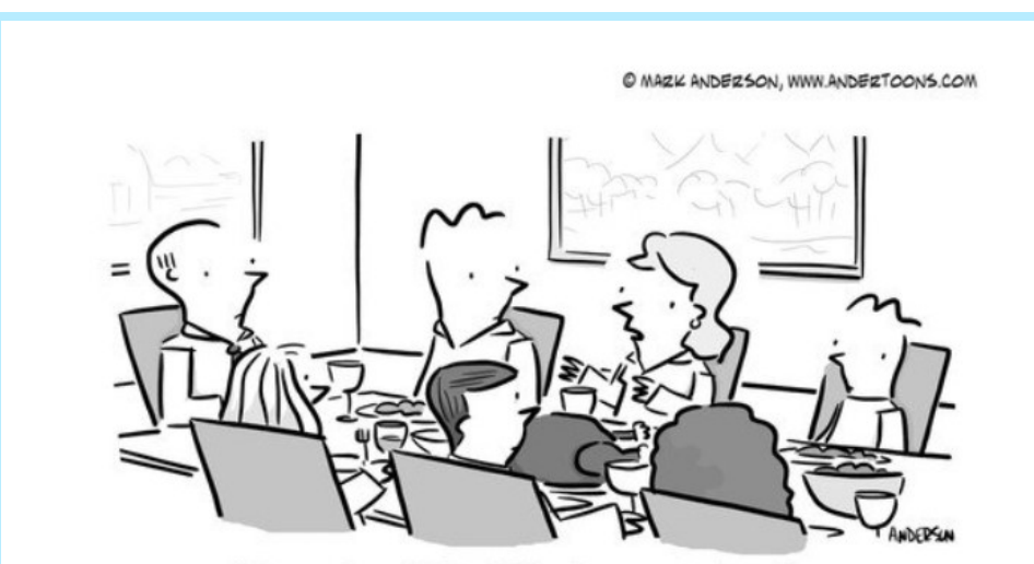
"I'm eating light. I don't want to be slow when I'm shopping in a half hour."

Unlike your business WiFi, many home wireless networks lack proper security, leaving a backdoor open to hackers. WiFi signals often broadcast far beyond your employees' homes and out into the streets. Drive-by hacking is popular among cybercriminals today.